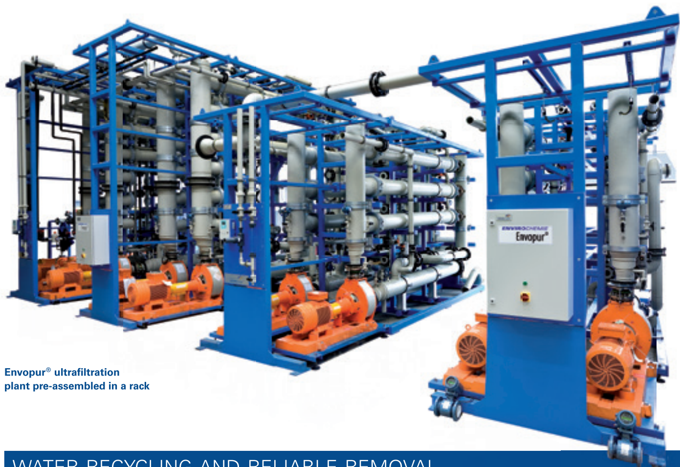
Envipur® ultrafiltration plant pre-assembled in a rack