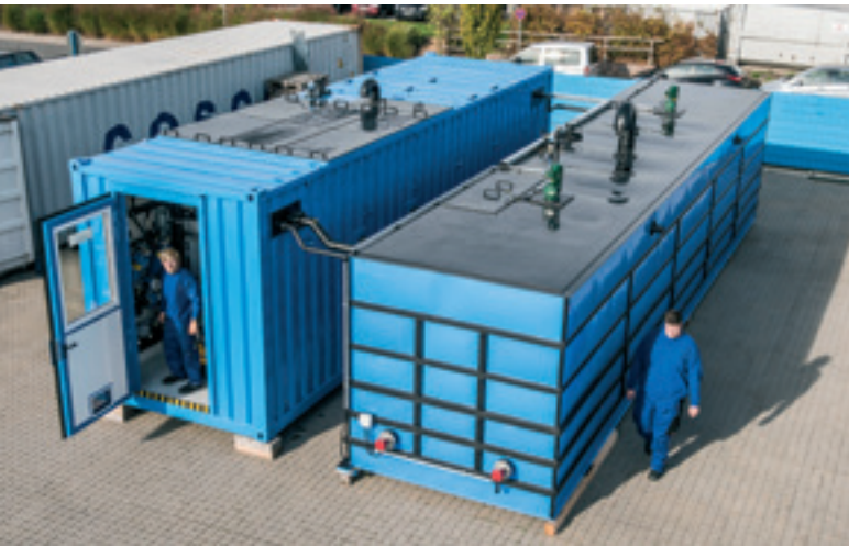
EnviModul – modular plant system with Biomar ® OMB membrane biology

In order to minimise their footprint wastewater treatment plants have gradually been incorporating state-of-the-art technologies such as membrane biological reactors (MBR) for the main COD (Chemical Oxygen Demand) reduction stage. In these reactors, ultrafiltration membrane modules are implemented as secondary clarifiers, making tertiary filtration stages superfluous.